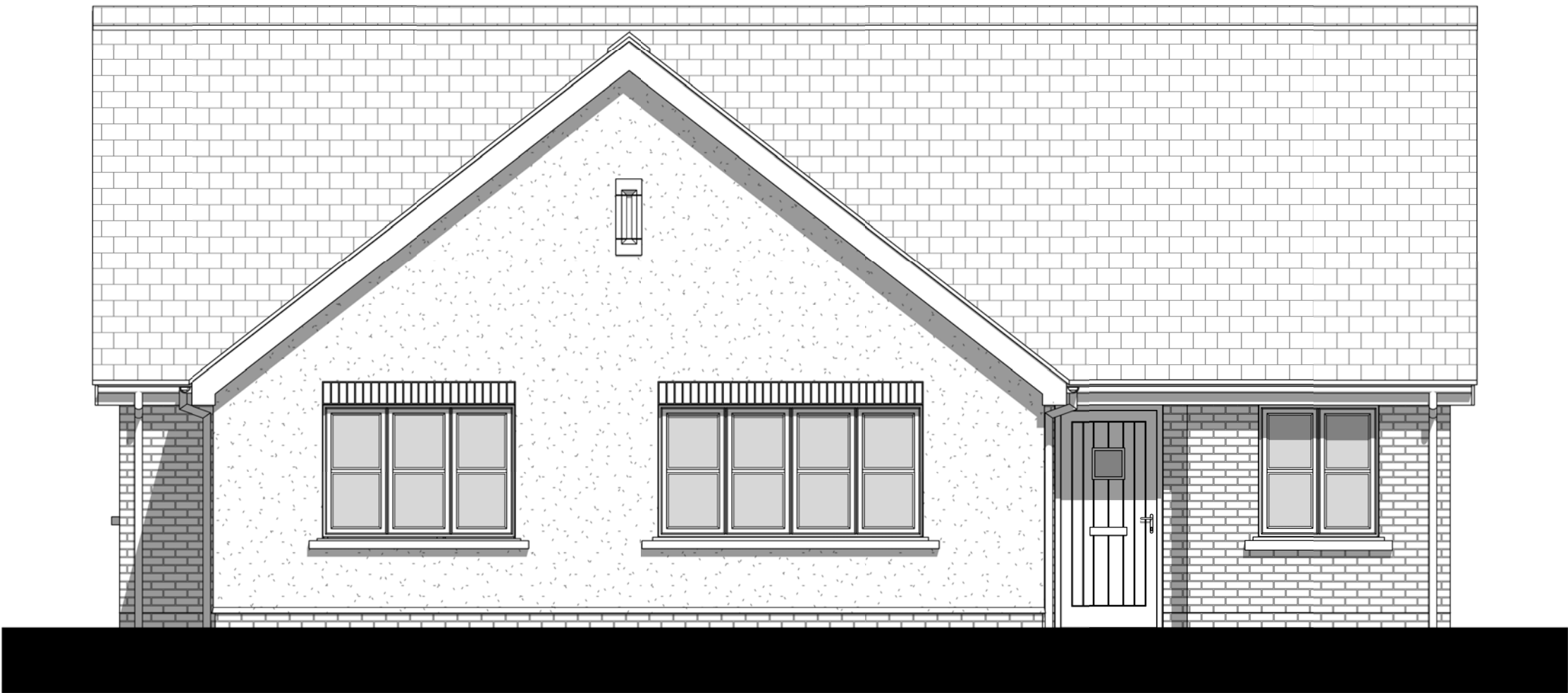
Front Elevation 1 : 50