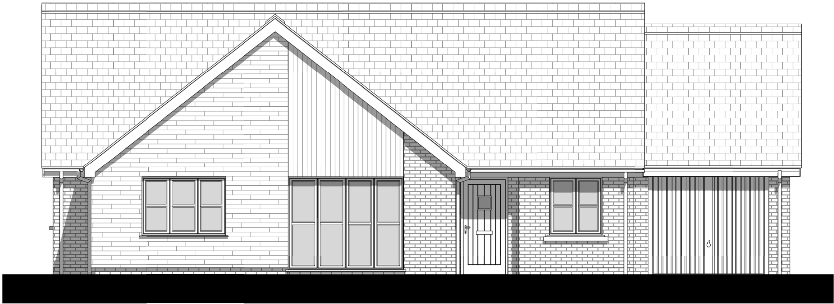
Front Elevation 1 : 50