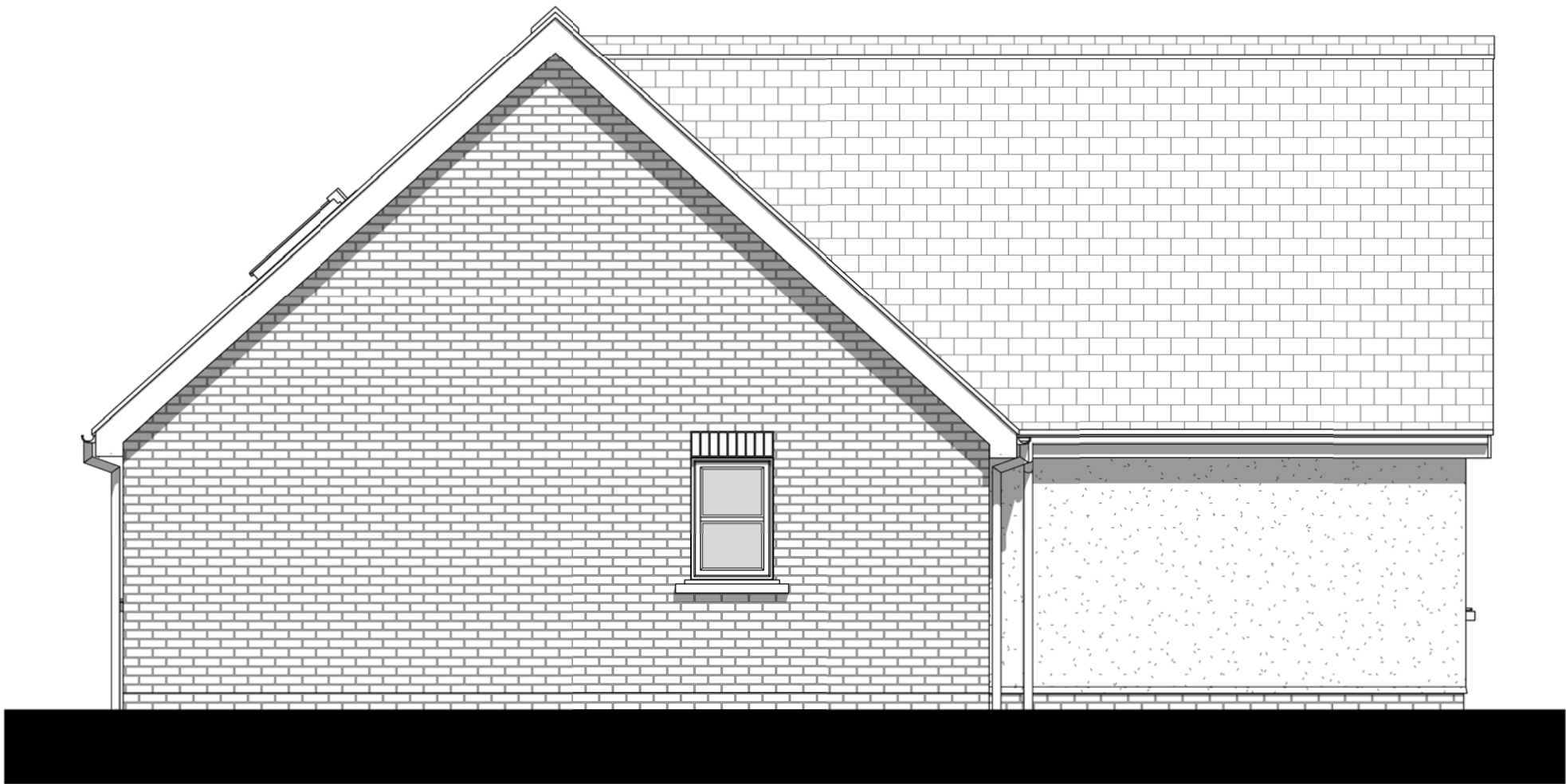
Side Elevation - Left 1 : 50