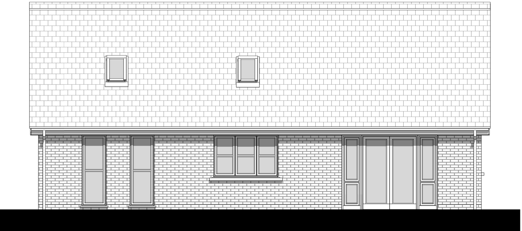
Rear Elevation 1 : 50