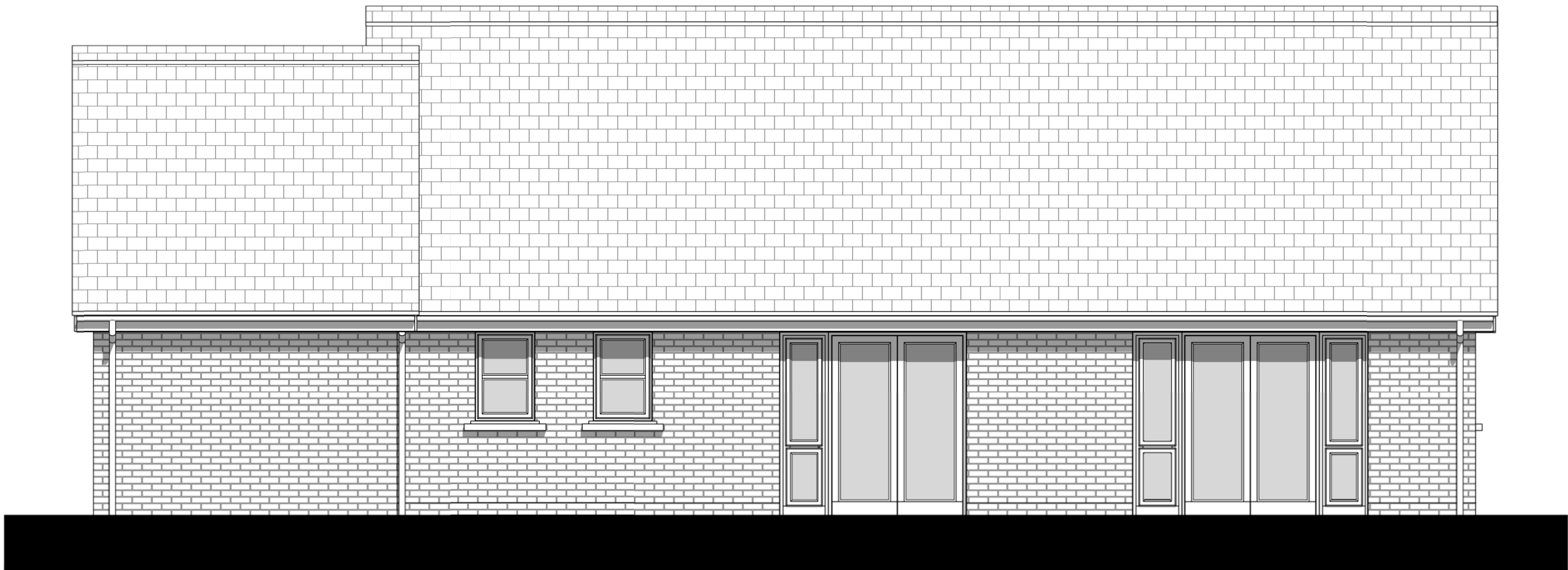
Rear Elevation 1 : 50