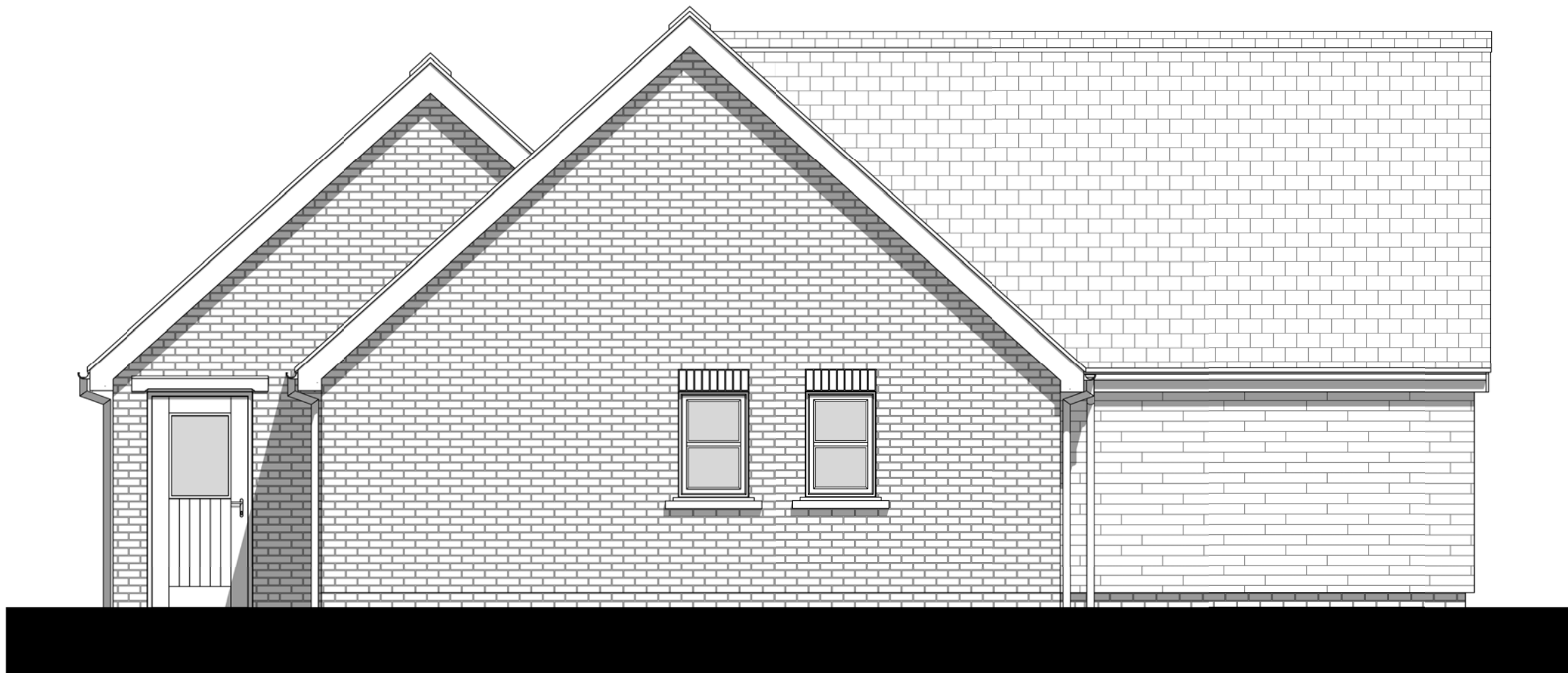
Side Elevation - Left 1 : 50