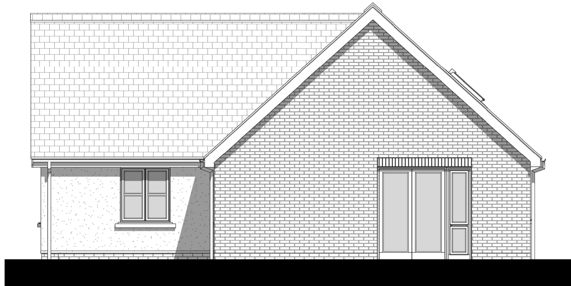
Side Elevation - Right 1 : 50